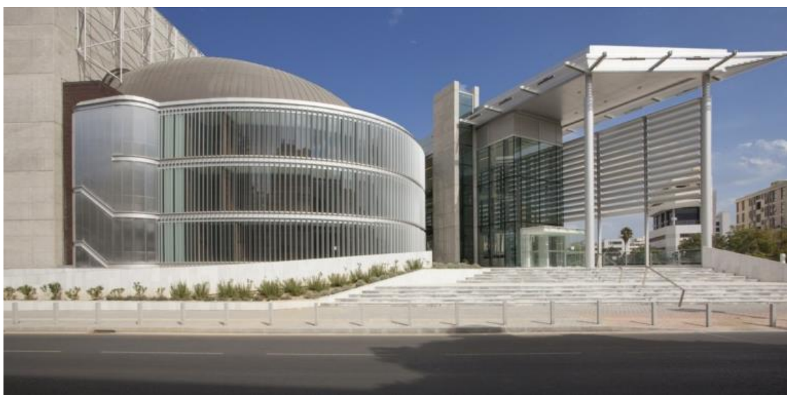
THOC Theatre in Nicosia

The European Heritage Excellence Day is jointly organised by Europa Nostra and the European Commission with the support of the Creative Europe Programme of the European Union. The event will take place at the THOC Theatre.